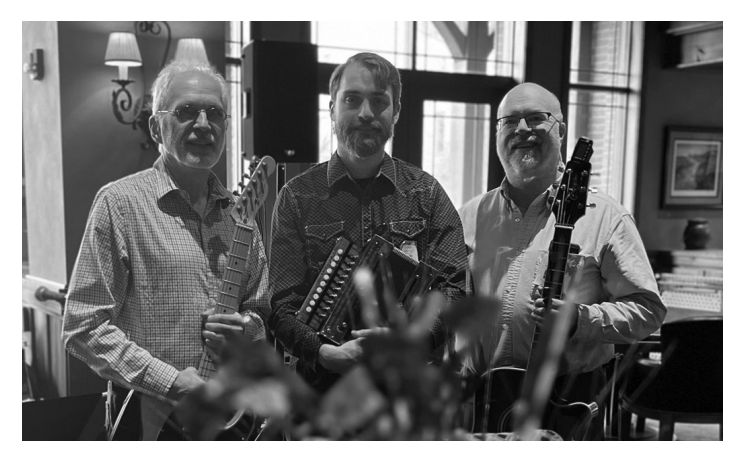
The truly phenomenal back-country cajun band, Le Travaillant, who performed on Lundi Gras!

This class offers a blend of exercises designed to improve core strength, coordination and flexibility. We utilize the ballet bars in Burnham.