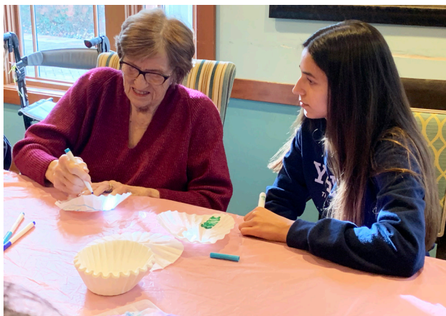
Crafts with the GlamourGals.