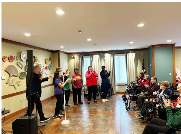
Prairieview staff dancing to My Girl .