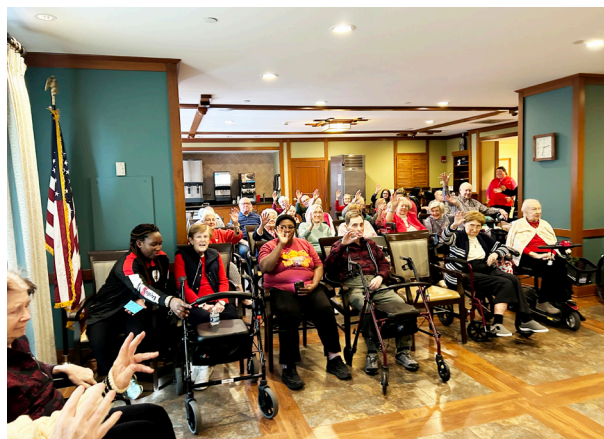
Members enjoying themselves and waving to the camera.