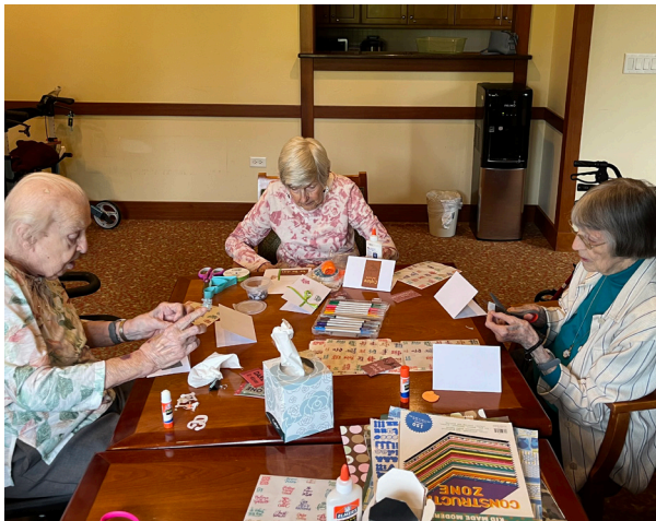
Members busy making get well cards.