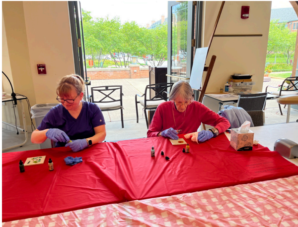
Members making a unique project with Kim's Art class.