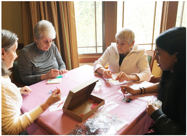
Members enjoying making a butterfly craft.

THE GARLANDS ® Inspira FEEL Better. AGE Better. LIVE Better.